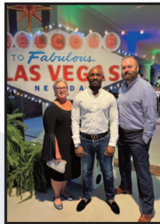
Funds from Casino Royale Catawba 23 will support a second mobile mammography unit to serve our area.

Over $600,000 provided by CMF to fund CVHS projects