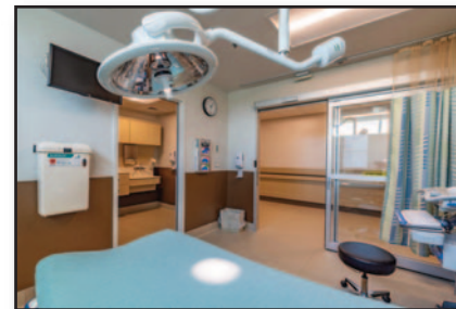
(left) new, larger rooms to treat patients; (right) blessing of the hands for those who serve our community

The Heart Center is part of a larger project that includes the expansion of our Emergency Department , which will feature an increased capacity to 45 treatment spaces and quicker access to ED treatment spaces improving 'door to provider' time and waiting room delays.